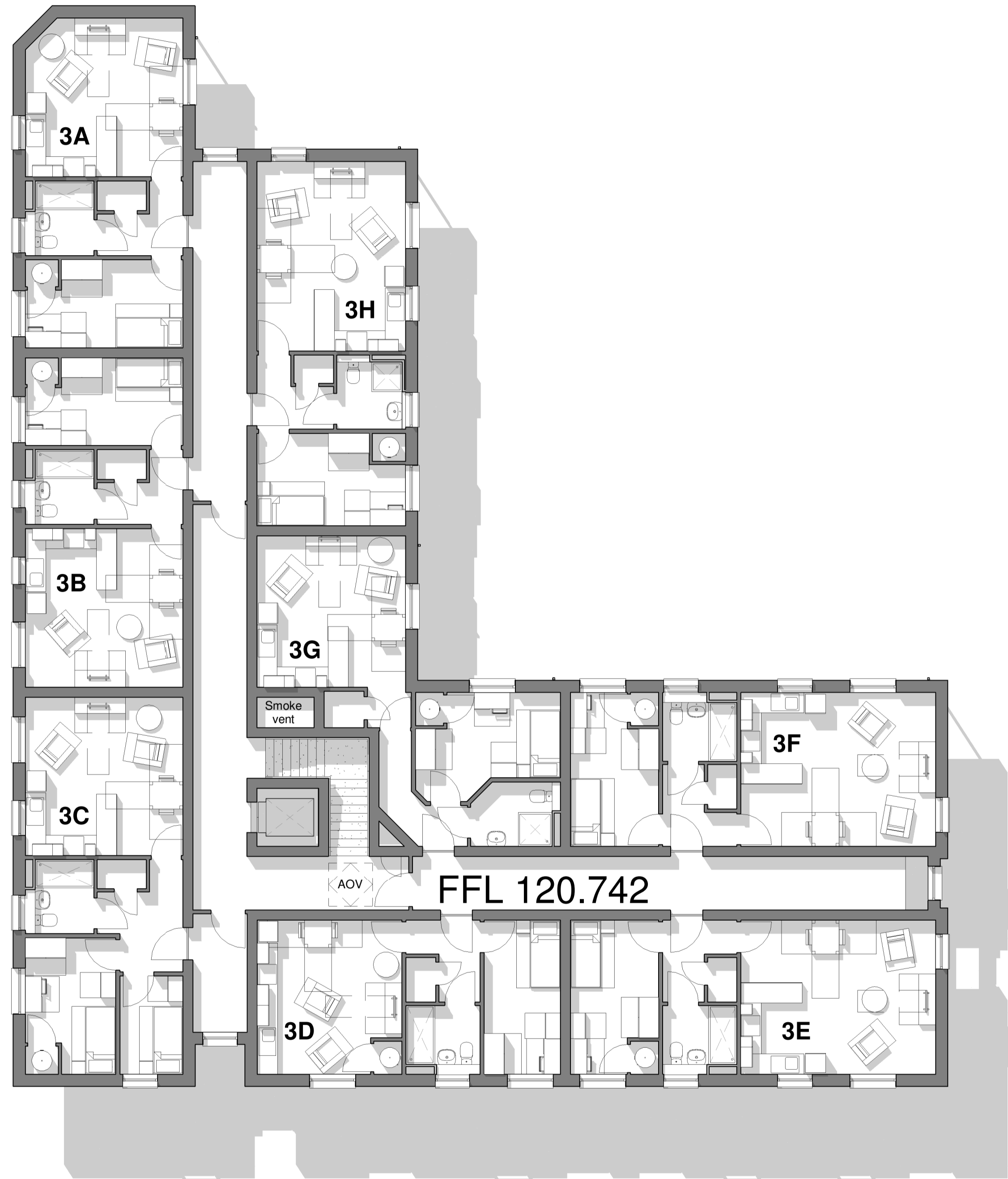
1 Level 3 Third Floor Plan 1 : 100